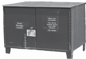
Food storage locker 3 ft x 4 ft x 3 ft

Rocky is renowned for its wildlife, and wildlife viewing is a favorite of many visitors. Help protect them by not attracting wildlife, including black bears, to your campsite due to improperly stored food. Bears can visit any time of day.